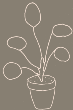
Chinese Money Plant