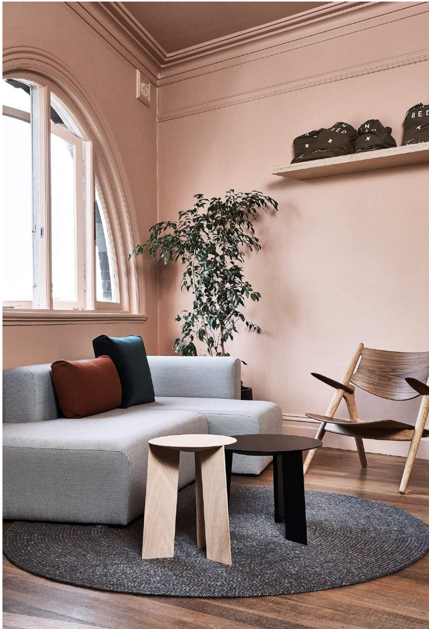
Plant featured: Ficus Benjamina