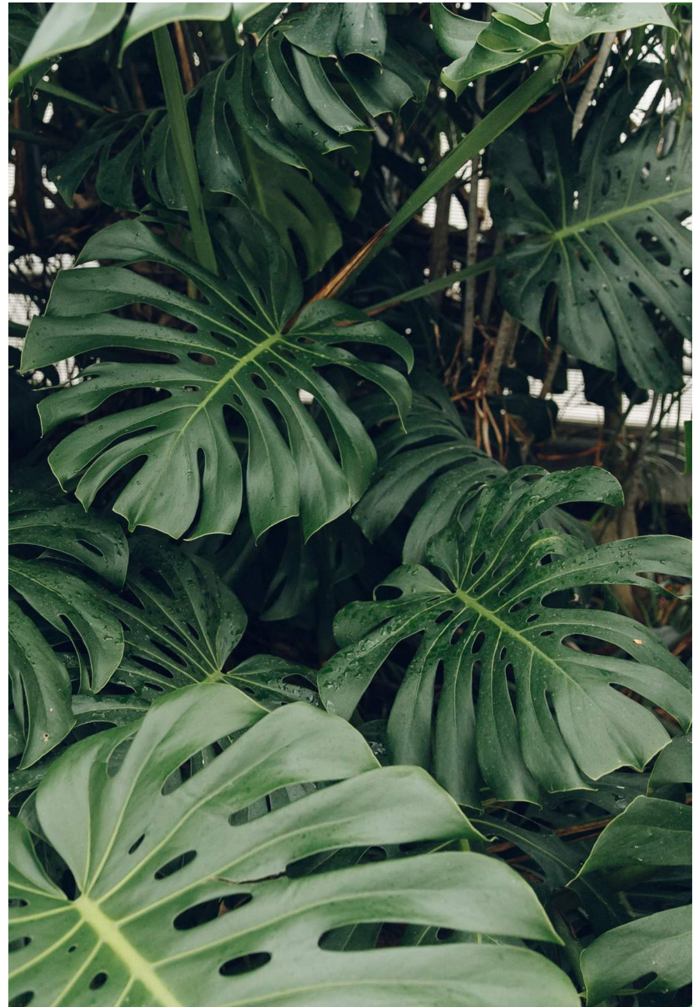
Plant featured: Monstera Deliciosa