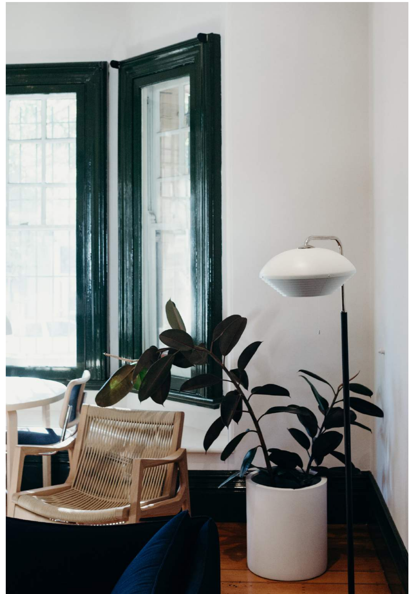
Plant featured: Rubber Plant