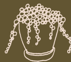
String of Pearls