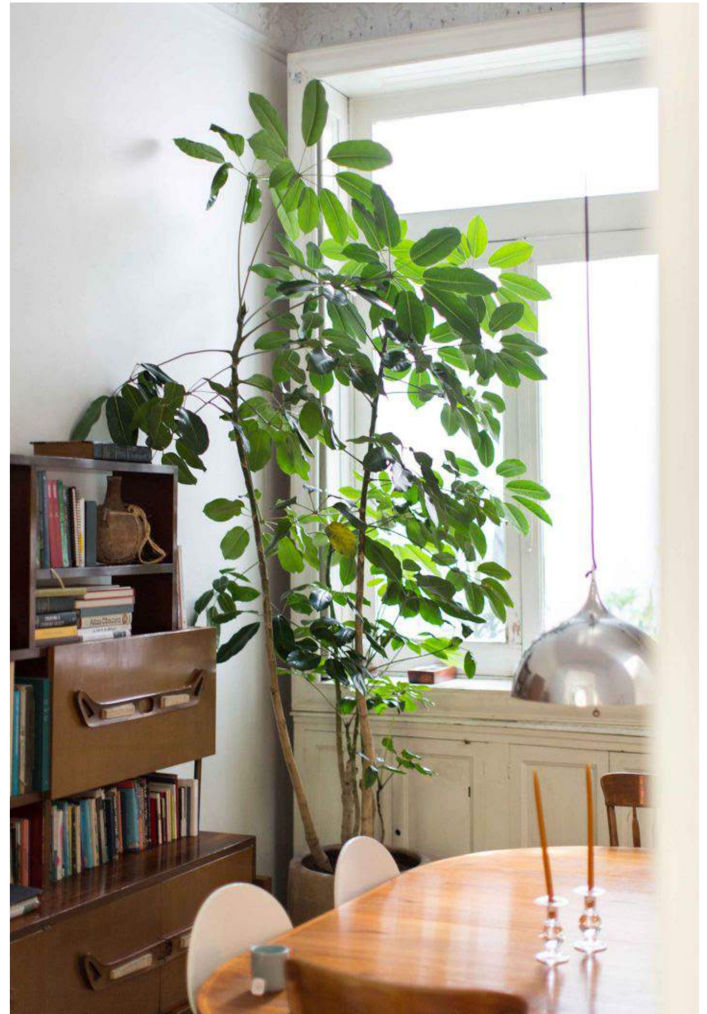
Plant featured: Umbrella Tree