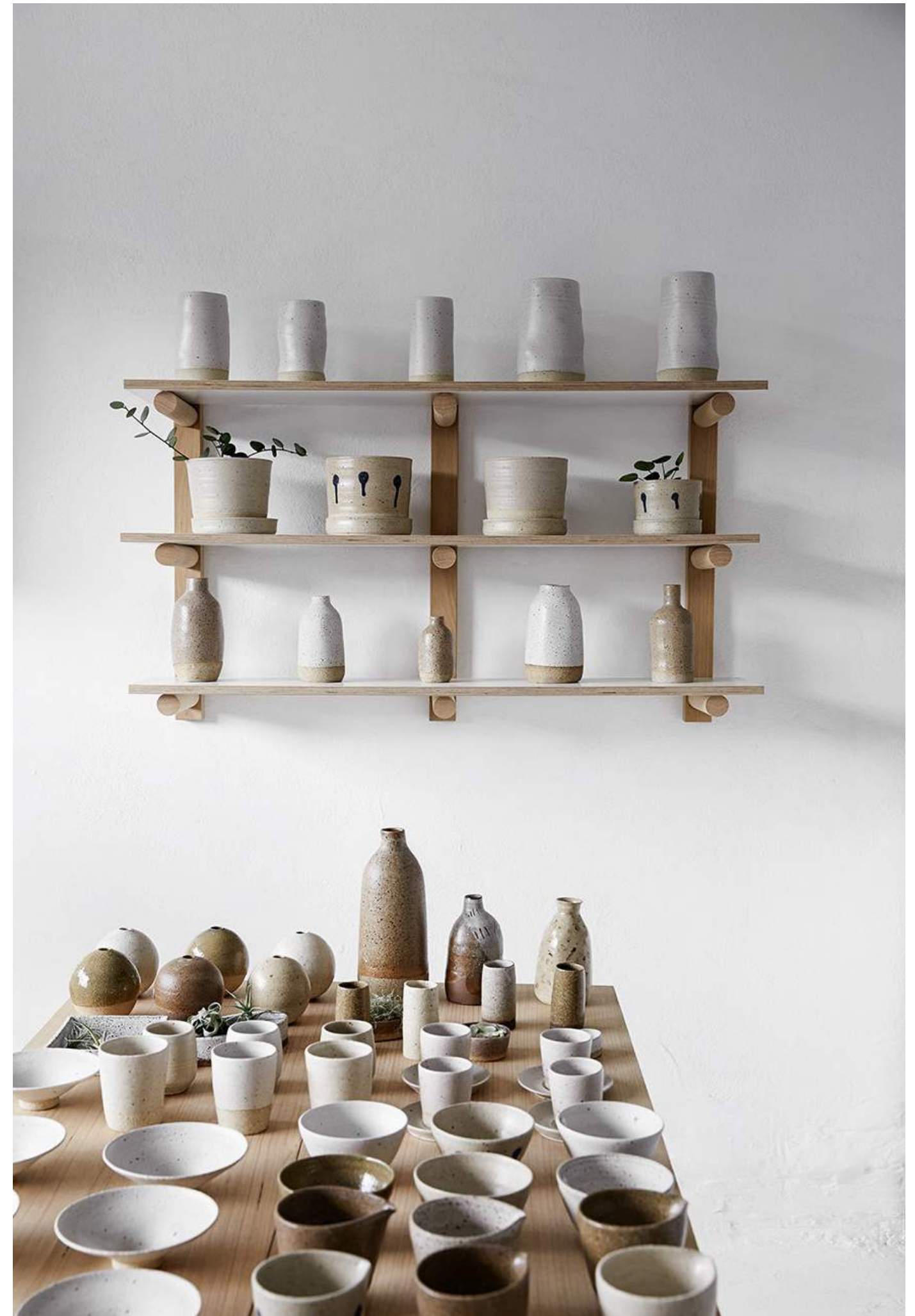
Store featured: Wingnut & Co

Stocks a range of beautiful plants and handmade pots, including some of our favourite ceramic brands. Manly | www.theplantroom.com.au